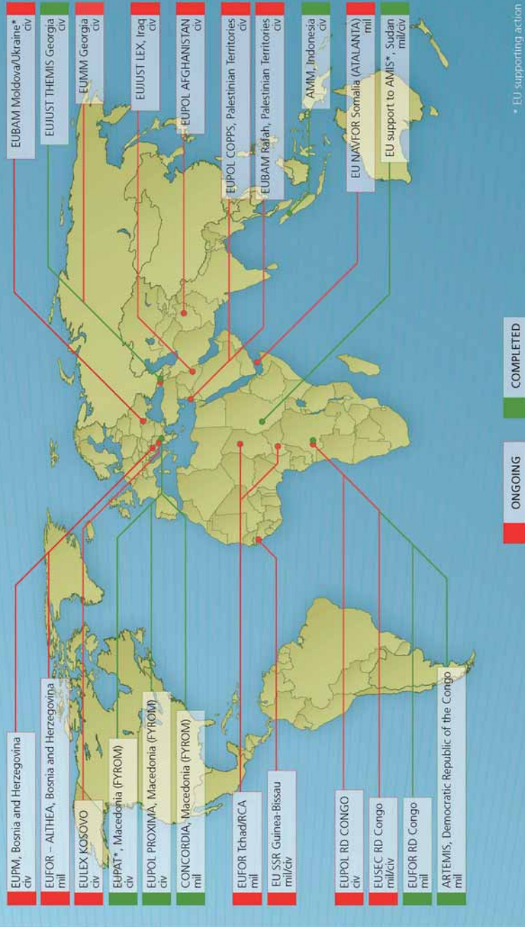
Ongoing and completed EU crisis management operations